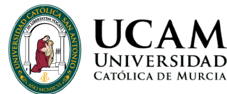
Universidad Catolica de Murcia