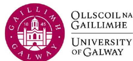
University of Galway